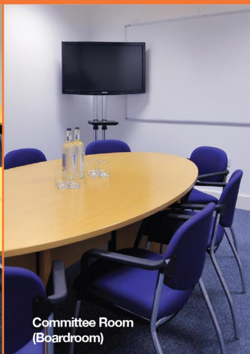
Committee Room (Boardroom)