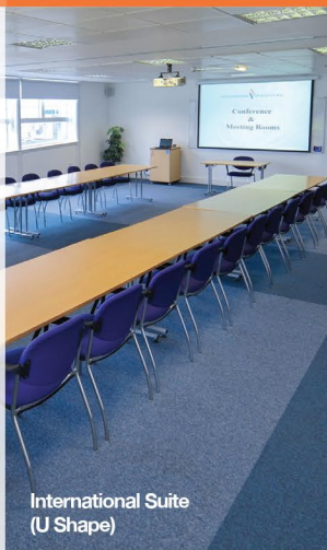
International Suite (U Shape)