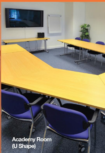
Academy Room (U Shape)